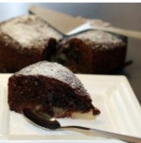
Chocolate Pear Cake