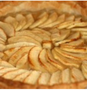
French Apple Tart