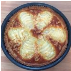
French Pear&Almond Tart