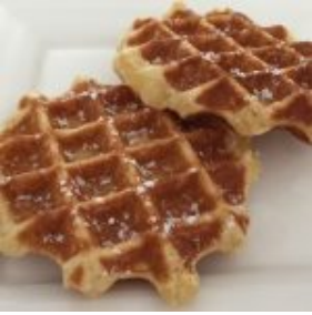
Belgian Liège Waffles